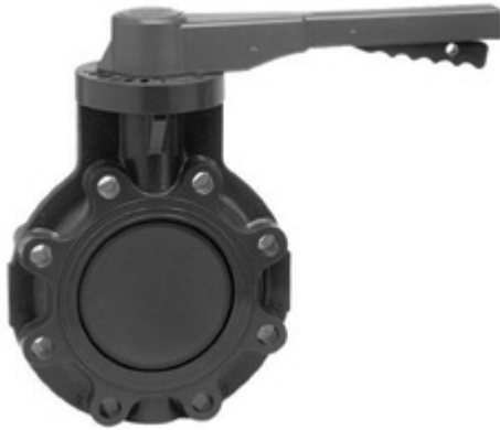
Lever Handle Style