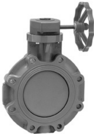
Gear Operator Style