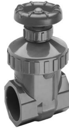
1/2" - 2" Socket/Threaded Style