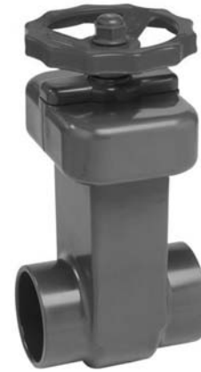
2-1/2" - 3" Socket Style