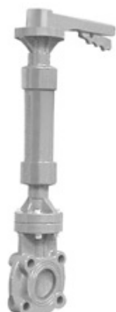
Valve not included

Basic Stem Extension height is 24" and is manufactured in standard 6" increments (heights less than 24" are at the same price). Intermediate Stem Extension heights are available and are priced to the next full 6" increment. Stem Extensions over 120" in height are manufactured and shipped in 2-piece sections. Please contact your servicing Spears® Regional Distribution Center.