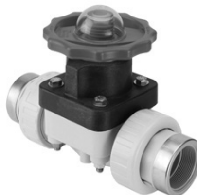
PP Thread Style