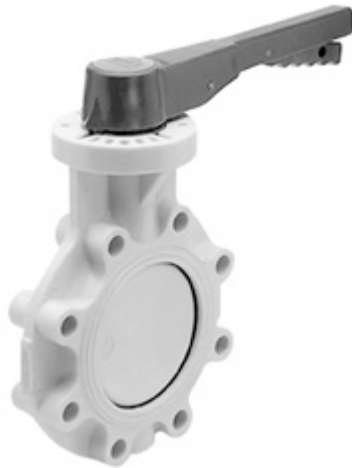
Lever Handle Style

Pressure Rating @ 73°F (23°C), Water 1-1/2" - 12" 150 psi