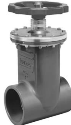
4" Socket Style