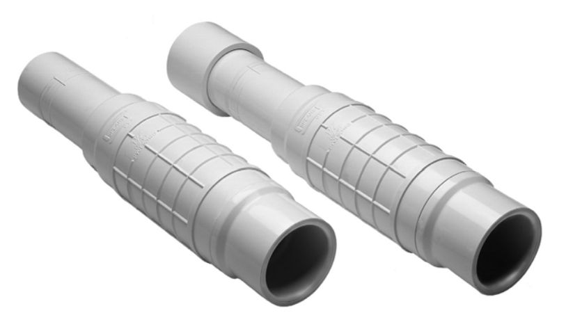
S118 & S119 Series PVC DWV Vertical Stack Expansion Joints