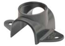
Drop Ear Bracket