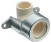
Drop Ear 90° Elbow