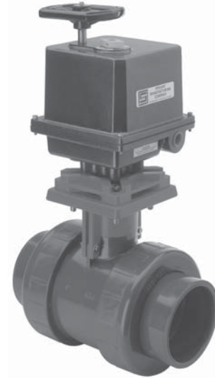
Declutchable Style Shown

Actuated package includes polypropylene valve mounting bracket for accurate valve/actuator alignment and support in any position. Premium electric actuator utilizes a reversing type motor with UL approved, built in thermal overload protection. Gear train is permanently lubricated with manual override standard. Enclosure is corrosion resistant polyester powder coated aluminum, weatherproof NEMA 4 rating, 1/2" NPT conduit outlet. All hardware is stainless steel. Includes 2-SPDT limit switches pre-wired for standard 115 VAC, 60 HZ.